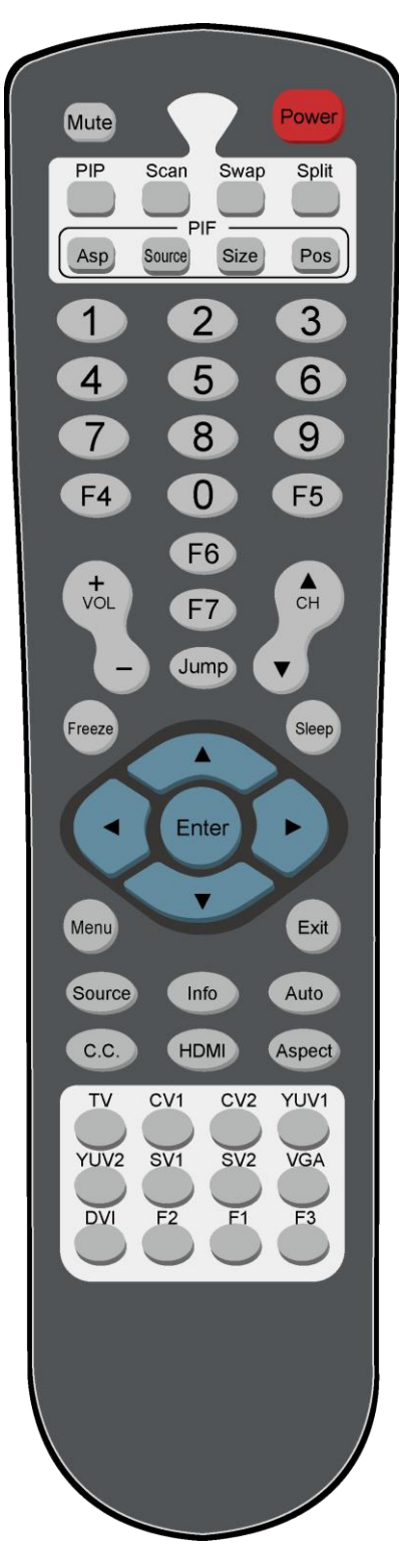
Figure 4: Remote Control

The MX-1010 is packaged with a remote control that allows for direct access to most commands used to control the video processor.